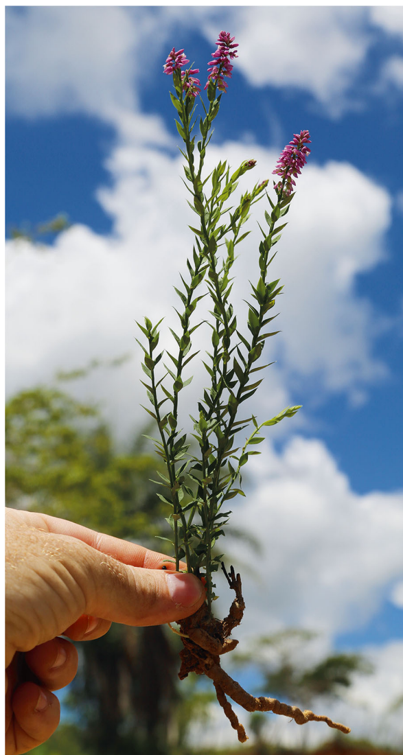
Fig. 2. Polygala minarum , whole plant, collected as Pastore 5084 (type).

without series). Almost certainly, these species are related each other and the current series delimitation in Polygala doesn't represent a phylogenetic perspective.