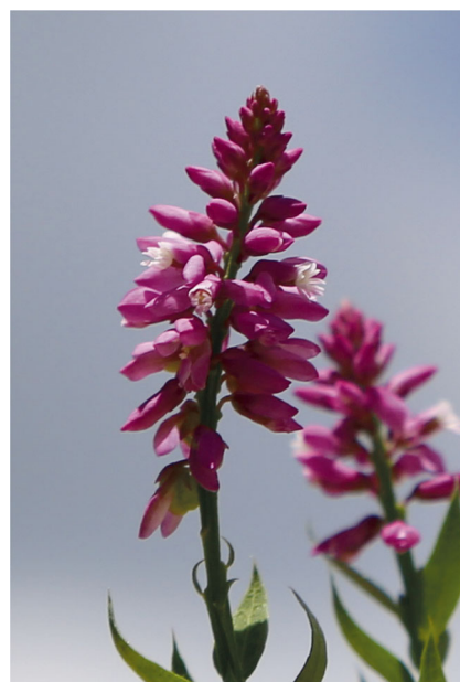
Fig. 3. Polygala minarum , inflorescence, collected as Pastore 5084 (type).

PHENOLOGY. Polygala minarum has fleshy roots and occurs in an area of rocky field ( campo rupestre ) where vegetation is not dense (low amount of